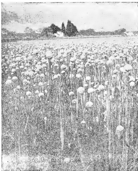
Field of Onion seed as grown for us in California